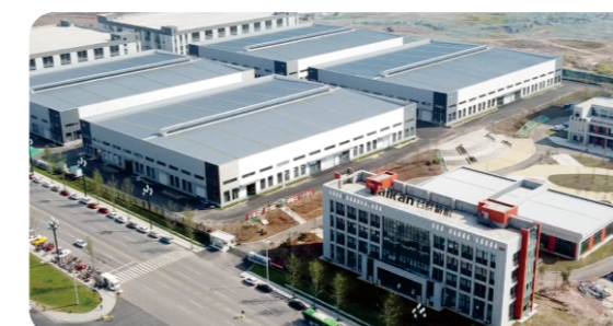
Yibin Industrial Park