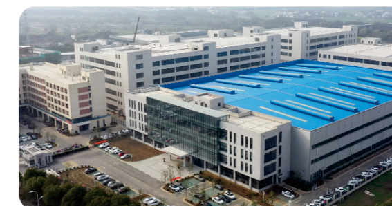
Suzhou Industrial Park