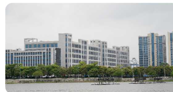
Dongguan Industrial Park

Guangdong Create Century Intelligent Equipment Group Co., Ltd. (Create Century for short; stock code: 300083) was publicly listed on the Shenzhen Stock Exchange in 2010, and underwent a transformation in 2016 to become an intelligent equipment Co., Ltd. in 2016. Create Century is a company that specializes in the research and development, production, sales, and service of high-end intelligent equipment. With nearly two decades of industry experience, it is capable of delivering top-quality equipment and comprehensive intelligent solutions to its customers. More importantly, Create Century stands out among similar domestic enterprises for its broad technological expertise and extensive product range.