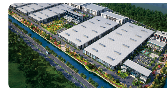
Huzhou Industrial Park